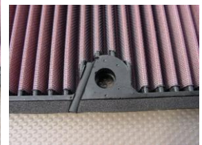
The 6 mm EVA seal in place.

If you have completed this stage go to instructions No. 3