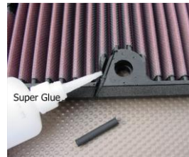
Applying Super Glue.