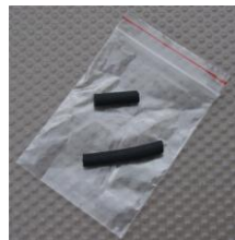
6 mm EVA foam seals.

The short 6 mm EVA seal can be used to seal the hole that the cable enters the rear side of the airbox.